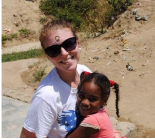
Savannah in the Dominican Republic.