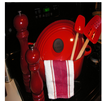
Celebrate Mardi Gras with Red Beans and Rice. Finish the meal with King Cake for luck.

garlic until tender. Add the smoked sausage, seasoning, thyme, salt and pepper. Saute for about 5 minutes then add the red beans, chicken stock and bay leaves. Let simmer uncovered on low for 1 1/2 hours. Stirring occasionally and adding water, if necessary. Serve over rice